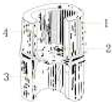
Fig. 2. 1-stalk wall 2-tabasheer 3bamboo pulp 4-bamboo bar