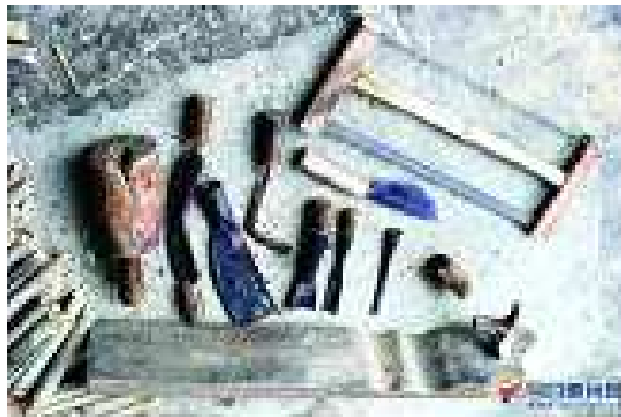
Fig. 3. Traditional bamboo craftsman common tools

Scraper. Mainly used for scraping bamboo bark, scraper is “edge steel”. The knife face is arched, edge and back are arc, end with wooden handle, in order to facilitate the use of the operator.